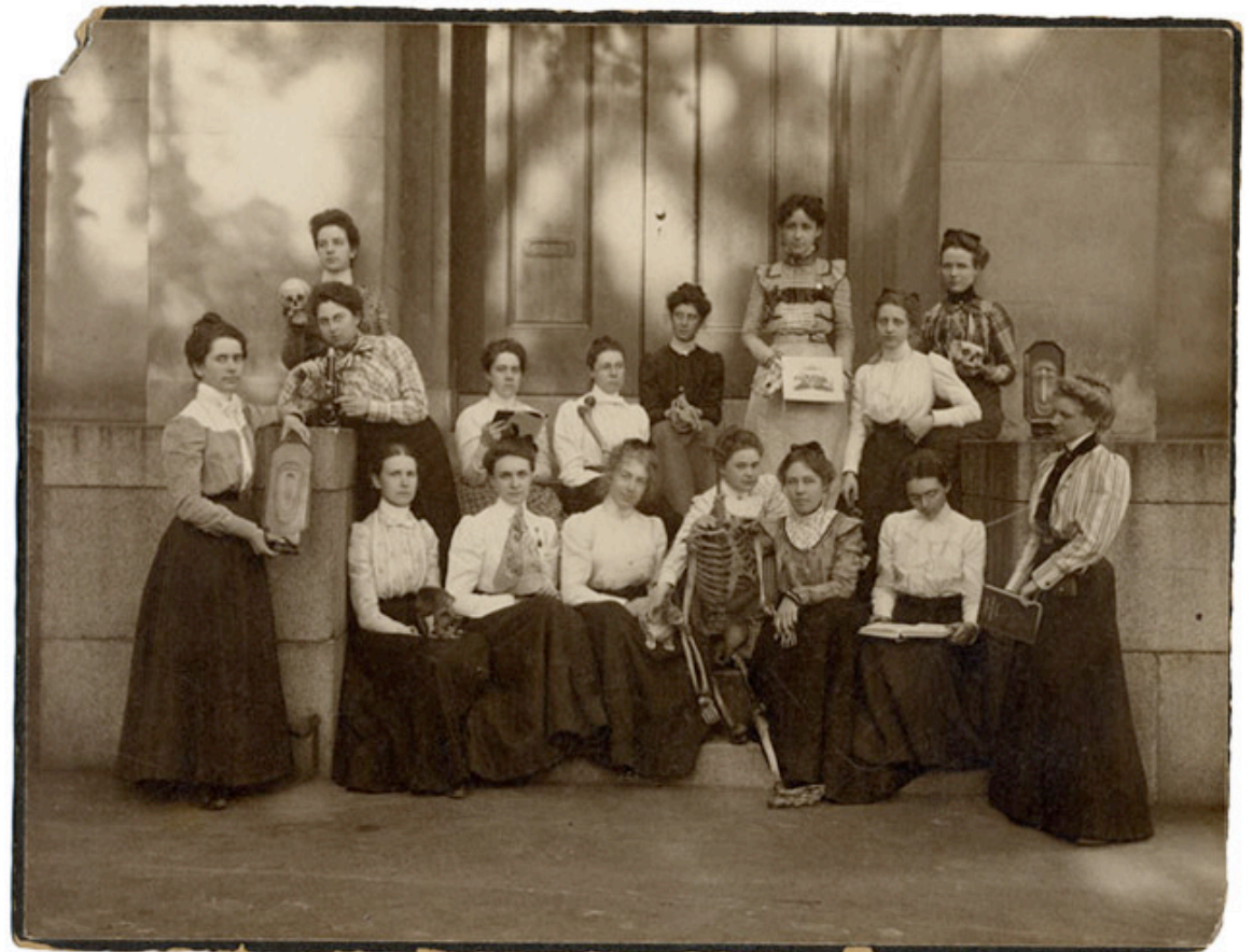
Anatomy Class, Pembroke College, 11 June 1905